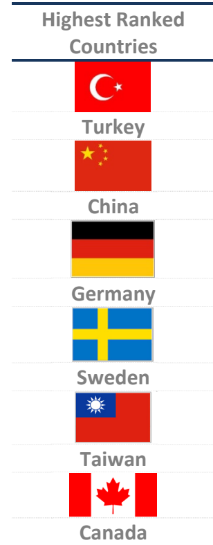
Chart 1 | Data is as of 01.31.15